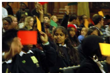
Voting in the House of Commons

Children as young as five are feeling the effects of living in poverty in England , a new report reveals, with some hiding their needs from their parents or giving their family money they received as gifts. These are just some of the findings revealed in 'Living with Hardship 24/7: the diverse experiences of families in poverty in England' launched by the Chancellor of the Exchequer at the City of London's Guildhall, as part of the Campaign to End Child Poverty's Month of Action.