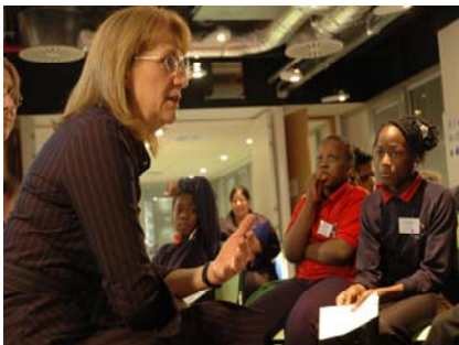
Beverley Hughes being interviewed

ECP had a successful Month of Action taking the Campaign to children, young people, government and business.