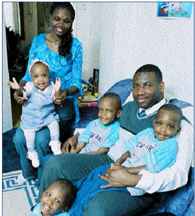
"Life would be a lot easier if we had a bigger place" — the parents and four children all sleep in the same small bedroom

"We couldn't have got through the last few years without God's and our family's help"